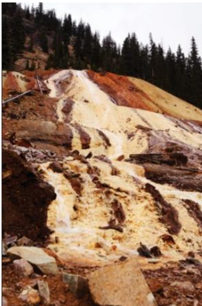
Gushing drainage at the Red and Bonita Mine

Acid mine drainage is a major problem in the West. In Colorado, over half of impaired streams are contaminated by metals, many from draining mines. Groups like Butler's want to help with simple solutions like this one, which has significantly reduced downstream levels of zinc, copper and cadmium. But overall, their impact is limited because many draining mines need actual water treatment -- something that small environmental groups won't do because: (a) it can be really expensive; and (b) they could be sued if the water still doesn't meet federal standards.