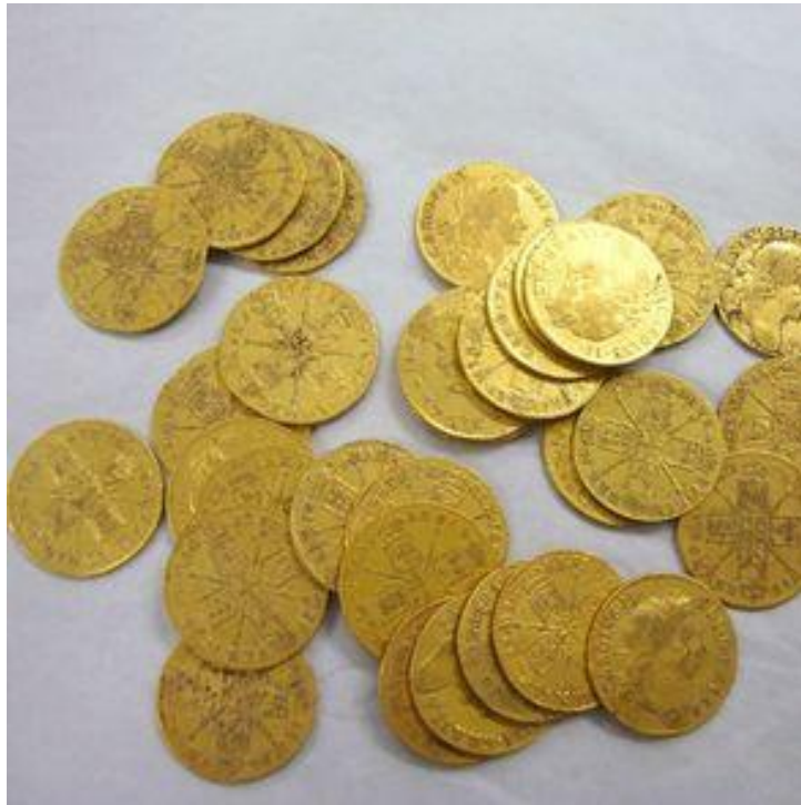
Some of the gold coins found underneath floorboards in a pub in Carrick-on-Suir by builders

http://www.belfasttelegraph.co.uk/news/local-national/republic-of-ireland/81-gold-coins-found-during-pub-work-16267420.html