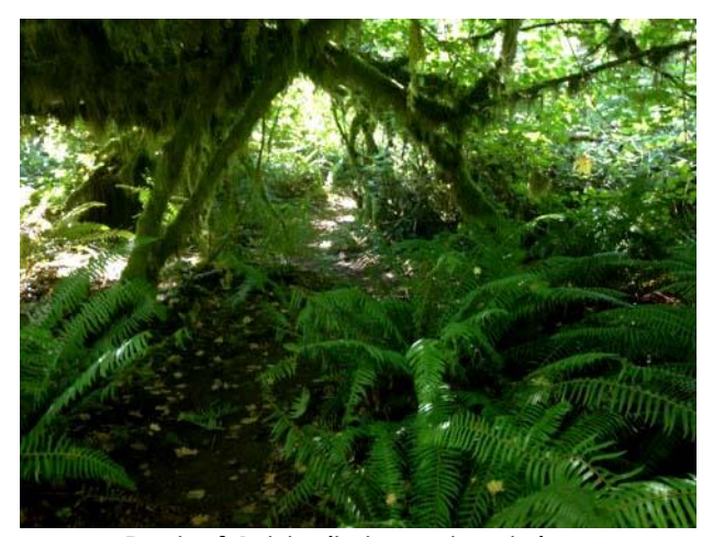
Part of 1st trail down to claim