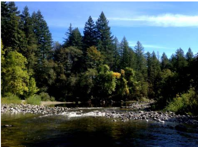
From 2<sup>nd</sup> trail, view looking downstream and then back upstream to NE end of claim.