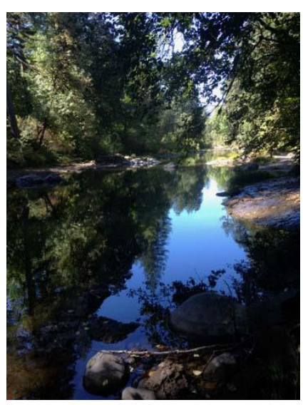
From 1st trail, view downstream NW end of claim Jeeter Crk dumps in @ NW end of claim