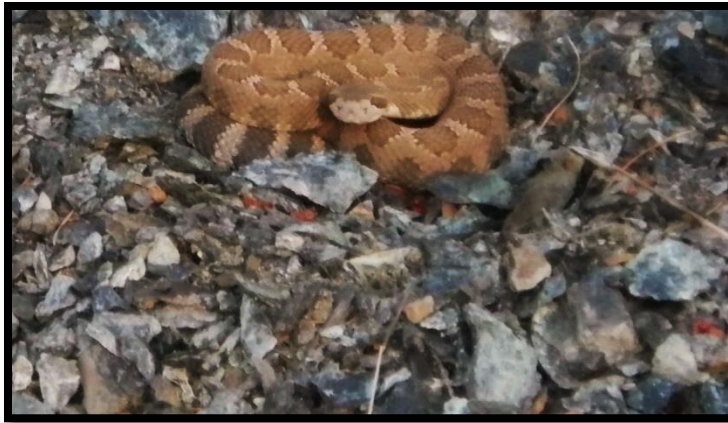
Here's a guy we saw on the road-cut we didn't want to disturb.