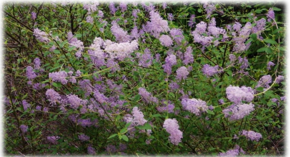
California Lilac all along roadside