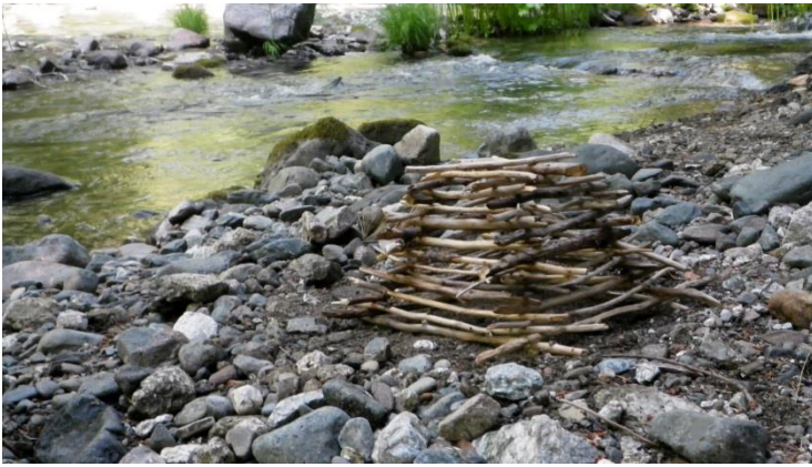
What to do with all those sticks? Build a stick structure!