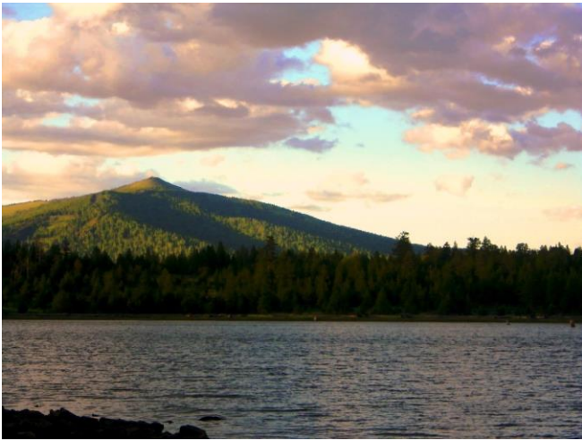
Thompson Res by the dam.