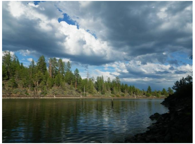
Hager Mtn and Thompson Res. We caught a lot of nice sized trout here.