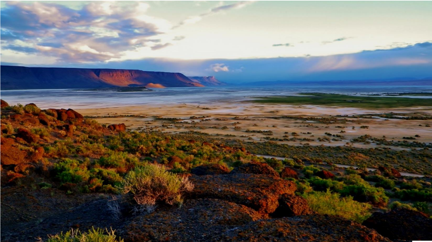
Looking south-(west of 395) View of Abert Lake (fault block valley) and Abert Rim (2,000 ft high fault scarp)