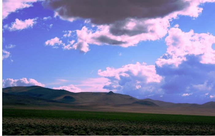
Thunder head, looks like a mushroom cloud from an atom bomb! Hogback Rd