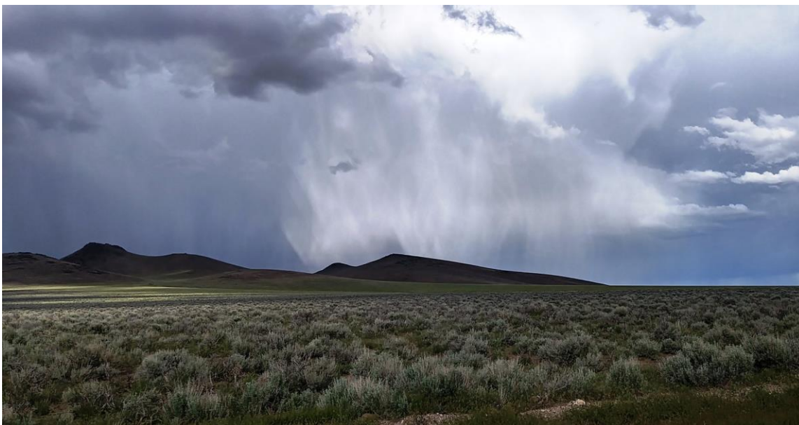
Heading up Hogback Rd, we just missed this cloud burst! It had left the ground white with hail.