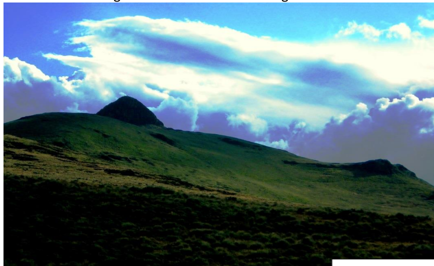
From Hogback Rd headed towards Big Rock Reservoir