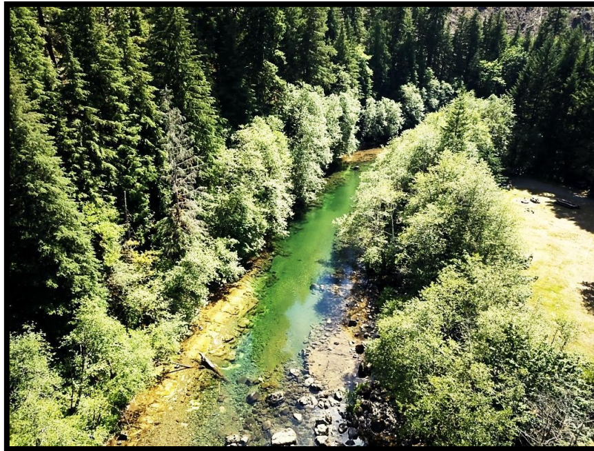
Looking downstream above Miner's Meadow (Drone)