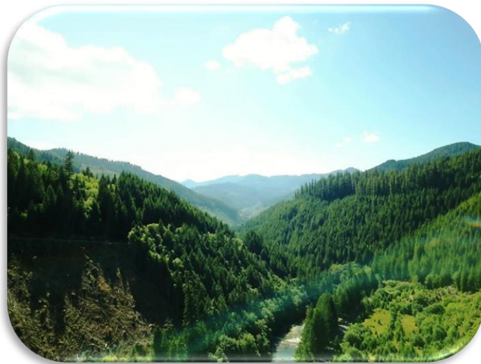
From Drone: Waaay up high above Quartzville Creek, Miner's Meadow