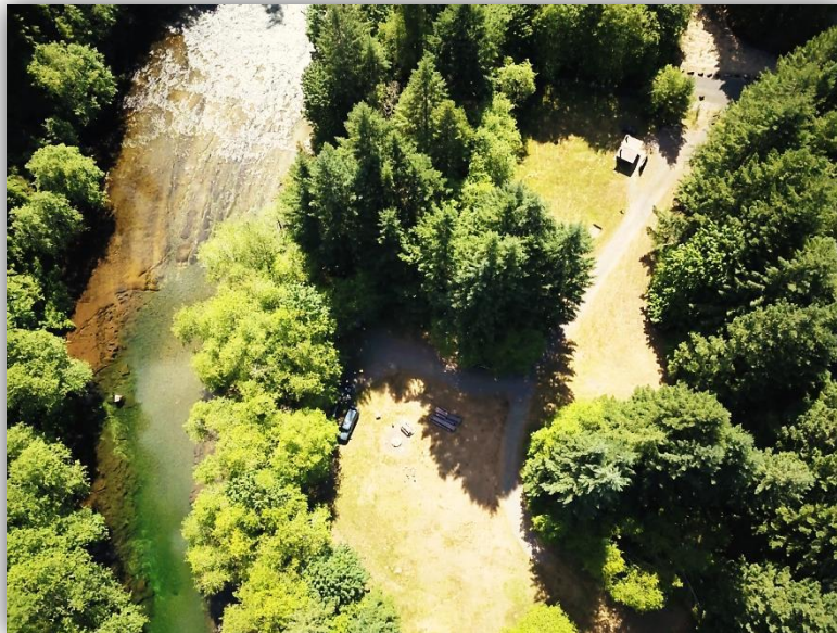
Miner's Meadow from on High! We're all down there on the left, looking up!